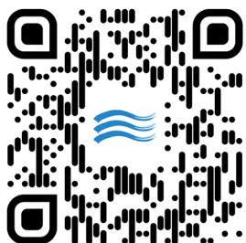
HERE IS WHAT'S COMING UP

WANT TO KNOW WHAT'S COMING UP AT ROCK CREEK NOW THAT OUR WORSHIP GUIDE IS GONE? SCAN THE QR CODE WITH YOUR PHONES CAMERA AND IT WILL LINK YOU DIRECTLY TO OUR WEBSITE WITH EVERYTHING RIGHT THERE FOR YOU! WANT THIS EMAILED DIRECTLY TO YOUR INBOX EACH MONDAY MORNING? JOIN OUR EMAIL LIST!