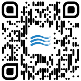
HERE IS WHAT'S COMING UP

WANT TO KNOW WHAT'S COMING UP AT ROCK CREEK NOW THAT OUR WORSHIP GUIDE IS GONE? SCAN THE QR CODE WITH YOUR PHONES CAMERA AND IT WILL LINK YOU DIRECTLY TO OUR WEBSITE WITH EVERYTHING RIGHT THERE FOR YOU! WANT THIS EMAILED DIRECTLY TO YOUR INBOX EACH MONDAY MORNING? JOIN OUR EMAIL LIST!