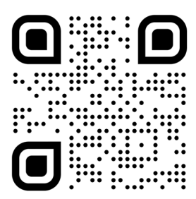
EMAIL LIST SIGN UP