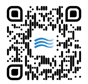
HERE IS WHAT'S COMING UP

WANT TO KNOW WHAT'S COMING UP AT ROCK CREEK NOW THAT OUR WORSHIP GUIDE IS GONE? SCAN THE QR CODE WITH YOUR PHONES CAMERA AND IT WILL LINK YOU DIRECTLY TO OUR WEBSITE WITH EVERYTHING RIGHT THERE FOR YOU! WANT THIS EMAILED DIRECTLY TO YOUR INBOX EACH MONDAY MORNING? JOIN OUR EMAIL LIST!